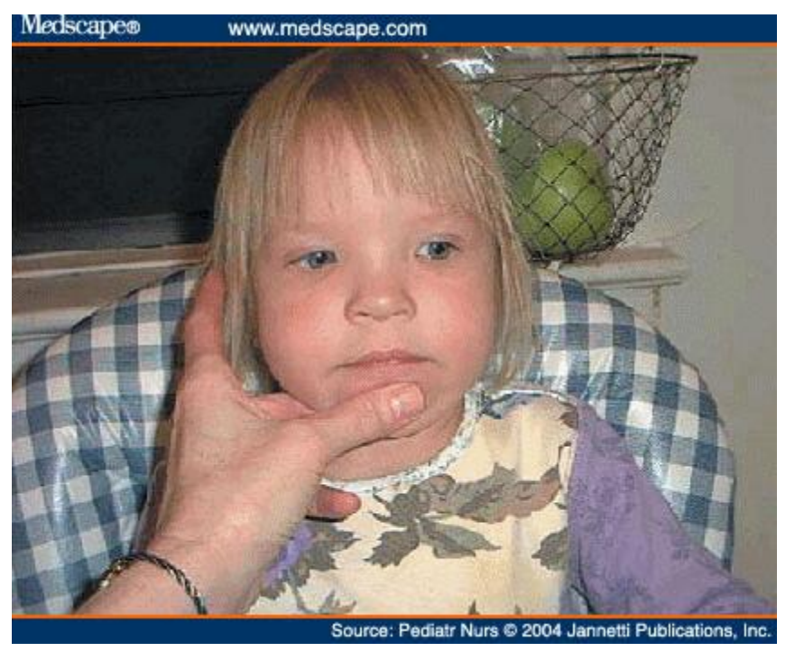
Figure 4. Front oral control allows for more interaction between the child and the feeder.

Oral control can be provided from the front (see Figure 4). In this case, the thumb is placed on the chin influencing jaw movements, while the middle finger is under the chin influencing tongue position. Front oral control permits eye contact between the child and the feeder but offers less oral control. It can be used with infants in infant seats or with children attaining fair head control who need a sensorimotor reminder to maintain head or jaw alignment. In general, infants require less oral control than older children. A premature infant's suck is often characterized by disorganization, but abnormal tone may not be apparent. These infants often need just one finger placed to give the mandible (jaw) enough stability to allow the other oral structures to move more efficiently.