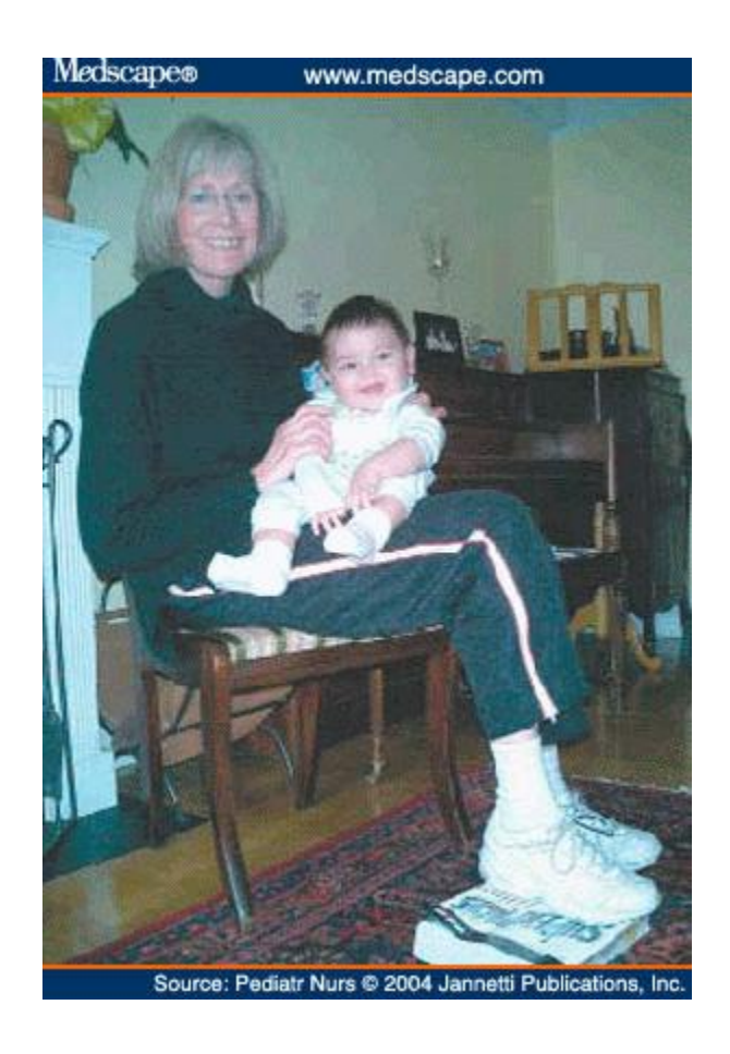
Figure 3. Positioning an infant on an adult's lap using the adult's thigh as a wedge to inhibit extension. The adult's foot is placed on a stool or foot support, raising one leg.

When developmentally appropriate, usually at about 6-8 months of age, the child should be seated in a seat or high chair. Ideal sitting posture for eating requires the hips, knees, and feet to be at 90 degrees with weight evenly distributed (Hall, 2001; Johnson & Scott, 1993). Again, the head should be at midline with the chin pointed downward slightly. Positioning in a chair allows eye contact with the feeder, facilitates communication, and in general makes feeding time more pleasurable. For those children with extensor patterns that include pushing back with increased muscle tone, the hip-flexion angle can be decreased by placing a wedge-cushion that is wider in the front under the child's knees.